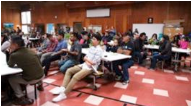
Students at Puente graduation