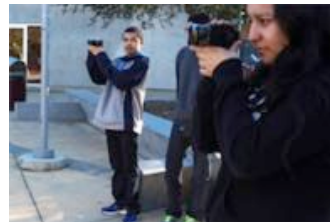
NV4Y students filming Spring term projects.

New Voices students are busy working on their Spring term projects. Menlo-Atherton students are learning about preparing for college and creating videos to tell other students and parents what they have learned. Our Siena Youth Center students in the North Fair Oaks neighborhood are also doing