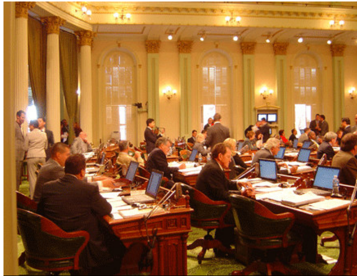
Inside the State Capitol

In 2006, the Speaker of the Assembly named