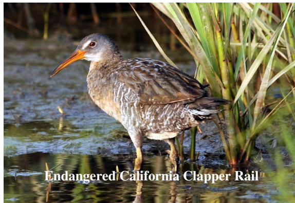
Endangered California Clapper Rail

Selecting a Program. Our overall program is determined by the membership starting with a general meeting of members. This will be our meeting on January 22. This program embody the issues that we choose for concerted study, education and action at local, state and national levels. Program can include both 501(c)3 education and 501(c)4 advocacy work. Our members, that is you, are invited